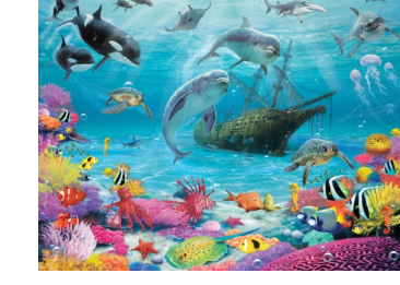
August 6-10 Pirates & Princess